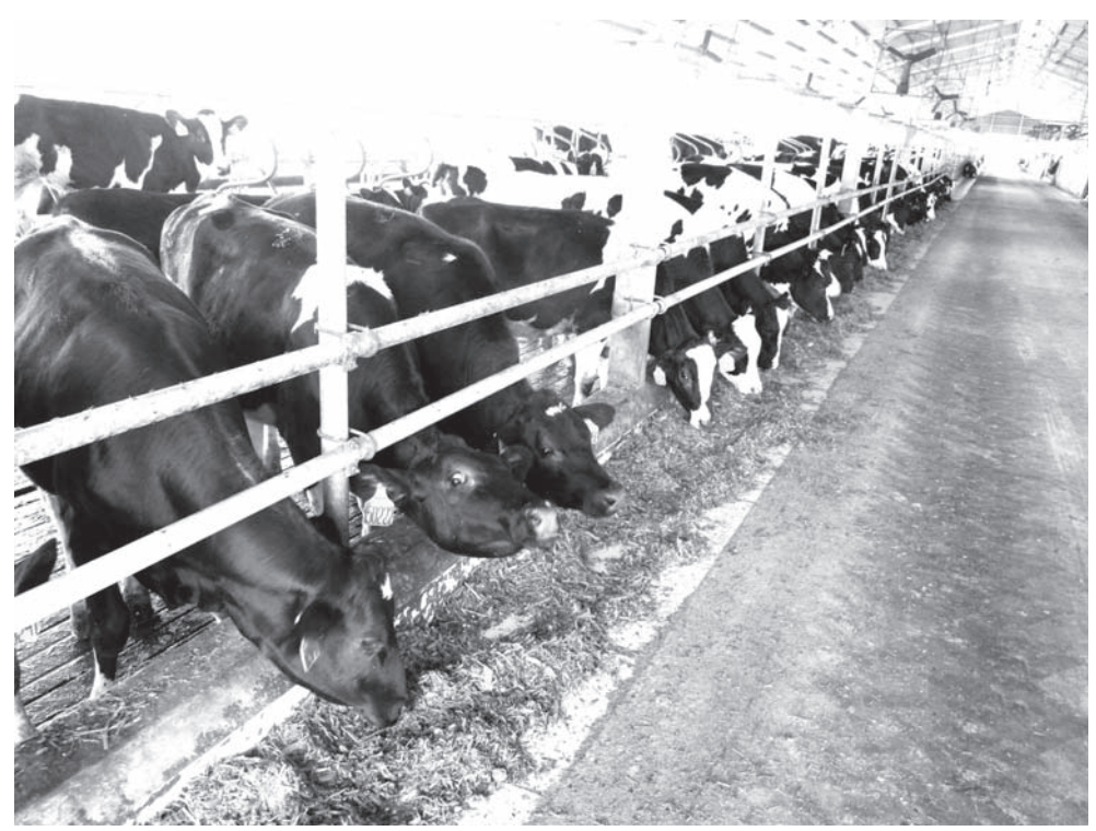
Figure 3.4: Once weaned and fed a concentrate based ration until 11 months of age in small groups, the heifers are then run together as a large herd in the free stall shed and fed a high quality total mixed ration based on maize grain and imported lucerne hay. Any constraints in feeding management have been minimised.