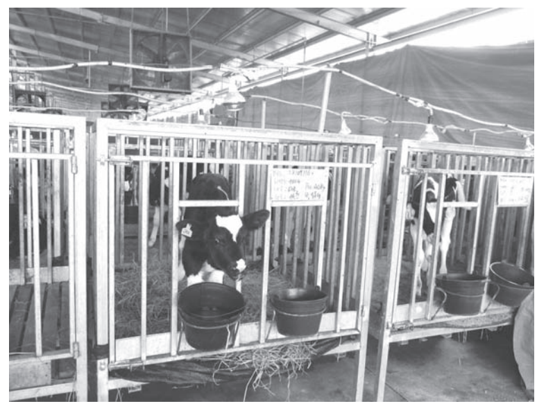
Figure 3.3: In comparison with Figure 3.2, the other extreme is this calf-rearing unit in a large-scale dairy feedlot in northern Vietnam. The Friesian calves are reared on calf milk replacer, as it is cheaper than whole milk, until 10 weeks of age with a target weaned live weight of 70 kg. Note the infrared heat lamps above the pens and the closed side walls, because winter temperatures and humidities can lead to cold stress in young stock. Clearly the environmental constraints have been minimised during winter.