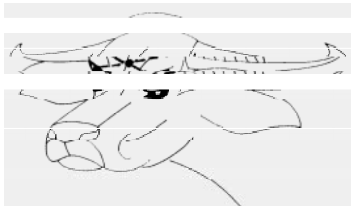
Figure 1: Humane destruction of buffalo — recommended position for frontal and poll methods (Suitable for firearm only)