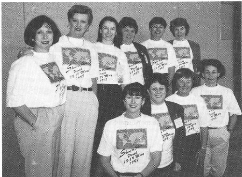
WA group advertising 1998 AICA Conference in Perth

Sub-Editor ICAWA, PO Box 674 Claremont, WA 6010