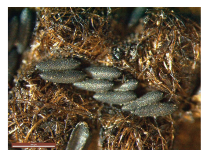
Figure 1. Cigar shaped Aedes mosquito eggs collected from an oviposition trap.

Pathway analysis is another important part of the response process. Determining the origin of an exotic mosquito and how it arrived