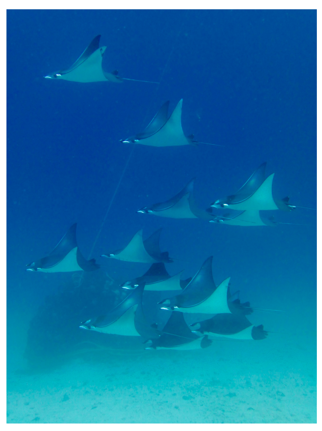
Fig. S2. A group of adult devil rays swimming in a sandy lagoon in Mangalonga Island.