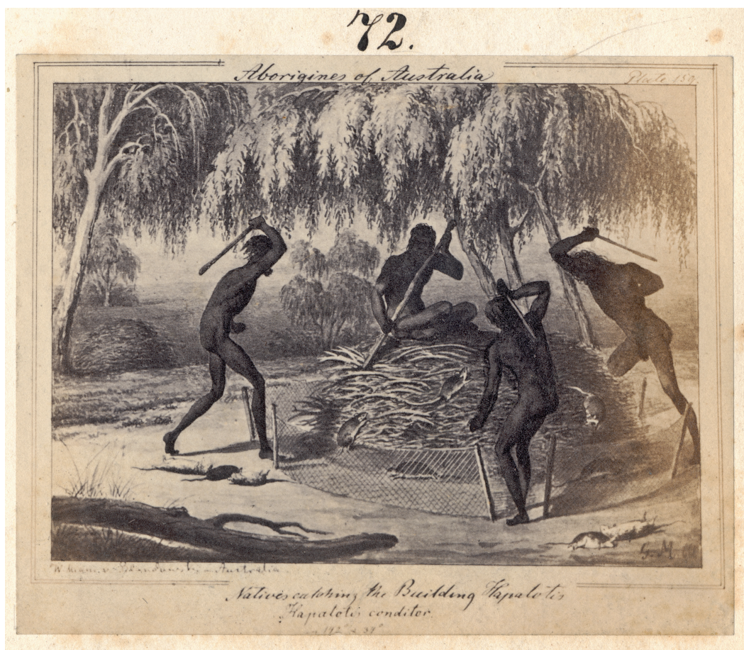
Fig. 3. Gustav Mützel: Natives catching the Building Hapalotis . Plate 72 from Blandowski's 'Australien in 142 Photographischen Abbildungen' (1862).

these water colours which survive in the collections of the State Library of New South Wales. These watercolours are assessed by John Kean (this volume) as providing an intimate view of both the animals and the Aboriginal persons depicted. A fine example is Krefft's illustration of a woman using a shell scraper to clean a fish (Fig. 5). It must have been an everyday scene to those living on the river, but it remains the only illustration of this activity we have from anywhere in Australia.