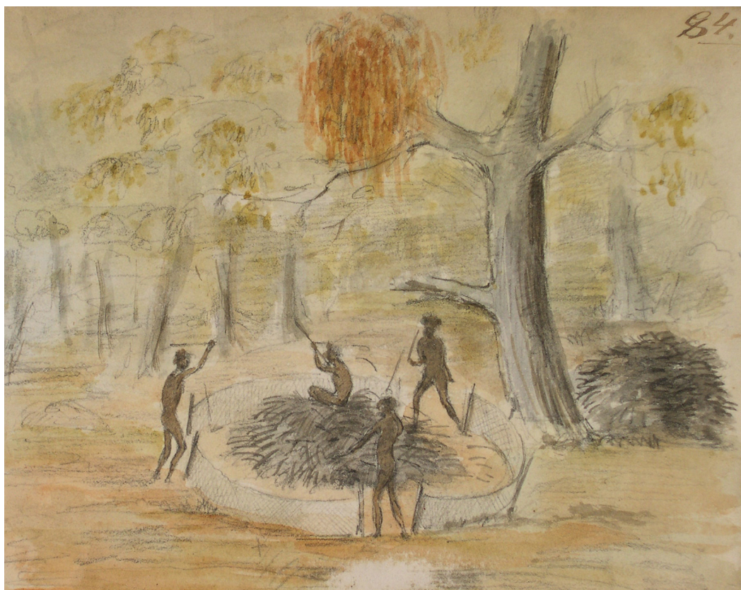
Fig. 2. Detail from Gerard Krefft: Hapalotis conditor , Building Hapalotis , "Koehl" YY. (Bl.) (now Leporillus conditor (Sturt, 1848), greater stick-nest rat). Reproduced with permission of Museum für Naturkunde der Humboldt-Universität zu Berlin, Historische Bild- u. Schriftgutsammlungen. Bestand: Zool. Mus. Signatur: B VIII/228. Blandowski Mammals.

tional details. Two examples will be discussed here. The first is Mützel's illustration of the construction of a bark canoe, 8 for which Krefft (1866b:362-3) provides a very full description (Allen 2006:35). Comparing Krefft's written account (1866b:362-3) with the one Blandowski provided to accompany illustration 34 (Blandowski 1862 in Allen 2007c; Kean, this volume) indicates that Krefft was recording an event he witnessed while Blandowski had little information beyond the sketch itself (Allen 2006:26).