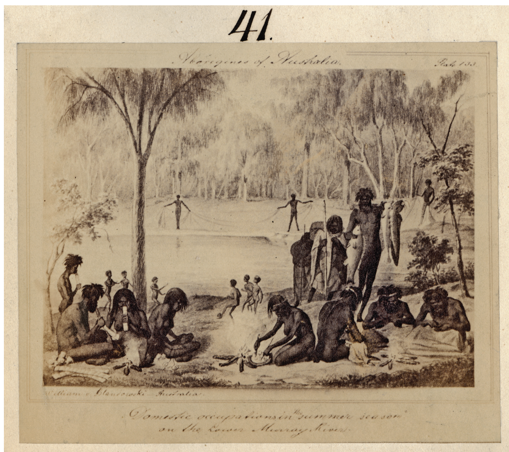
Fig. 4. Gustav Mützel: Domestic occupations in the summer season on the Lower Murray River. Plate 41 from Blandowski's 'Australia in 142 Photographischen Abbildungen' (1862).

the documentary. While he wished to create an encyclopaedia of Australian natural history and Aboriginal life, behind this aim lay the ambition to make his name as an explorer and naturalist. He answered critics who claimed that he wished to preserve Aboriginal culture '...at the expense of stopping the advances of Caucasian civilization', stating,